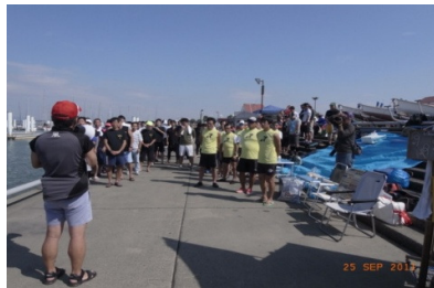
Safety first, BBQ after