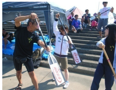
Show me how to paddle