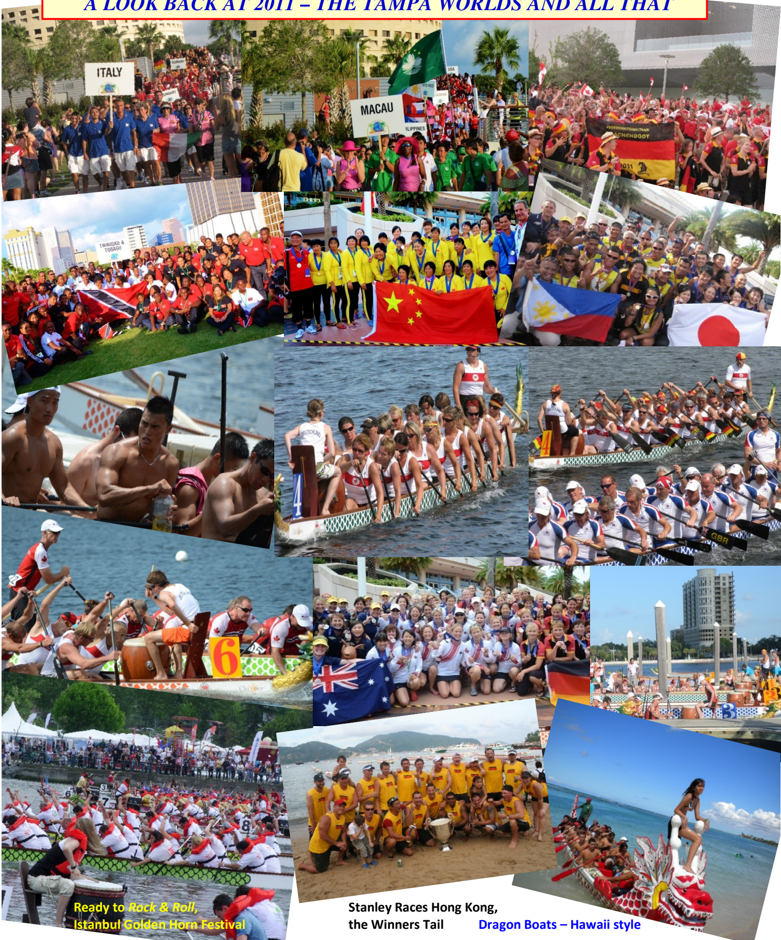
Ready to Rock & Roll, Istanbul Golden Horn Festival