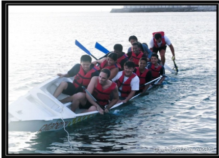
Prepare to capsize – rock & roll the boat