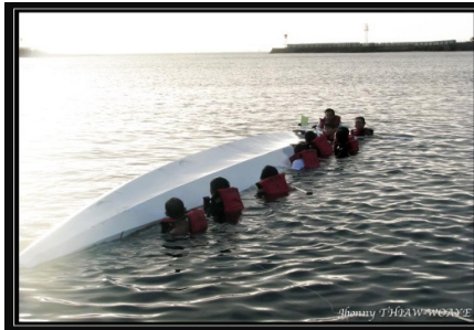
Double check your Buddy is there