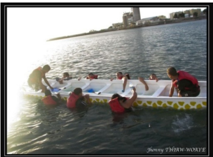
Put Crew back in boat - one at a time