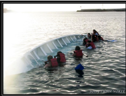
Control the roll back up – final flip