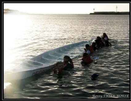
Stabilize the boat and prepare to bail