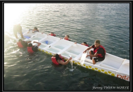
Stay with your Buddy and keep bailing