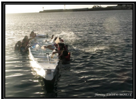
Crew evenly on both sides – bail out