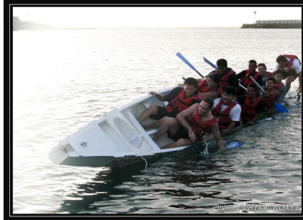
The tipping point - take care, be aware