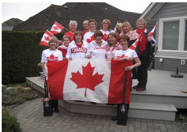
Getting ready for the Queen's Jubilee Pageant. Abreast from the West, Vancouver- Canada