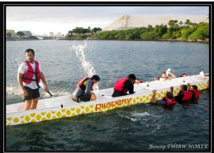
Helm returns – takes control