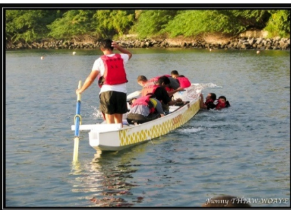
Remaining paddlers back in the Boat