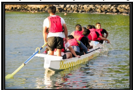
Return to shore – 5 minute target max