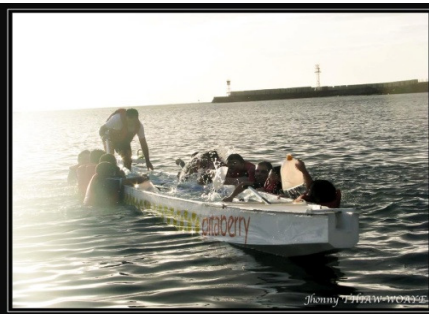
Bail out and boat lifts out of the water