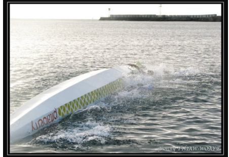
Over we go – then look for your Buddy