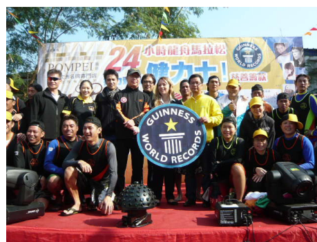
Photos: Guinness officials with Org Committee Left: U-Hearts a beneficiary (lady) with the title Sponsor Pompei (on right of picture). Far Left: The Hong Kong Police Team, highest fund raising crew.

In total the crews paddle 227 km during the 24 hours and raised around HK$ 600,000 (US$77,000.00) along the way. The Hong Kong Police crew raised the most money and all the funds go towards school building projects and education grants to children in rural China