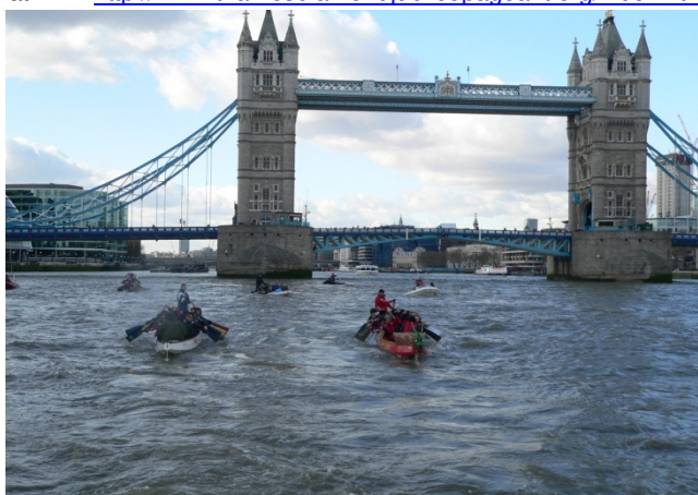
Through the Finish Line – Feb 2012 practice day.