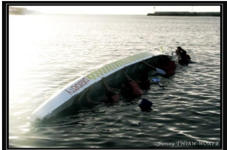
Lift up and push away from the Crew