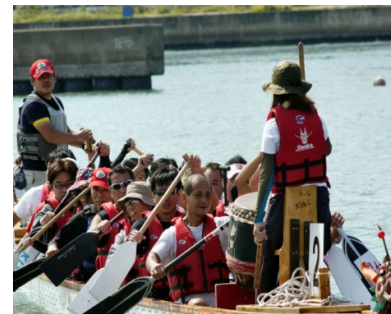
Are you ready or NOT ?