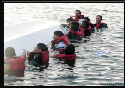
Prepare to turn the boat back over